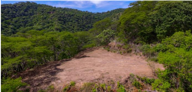
Lower Level Building Pad