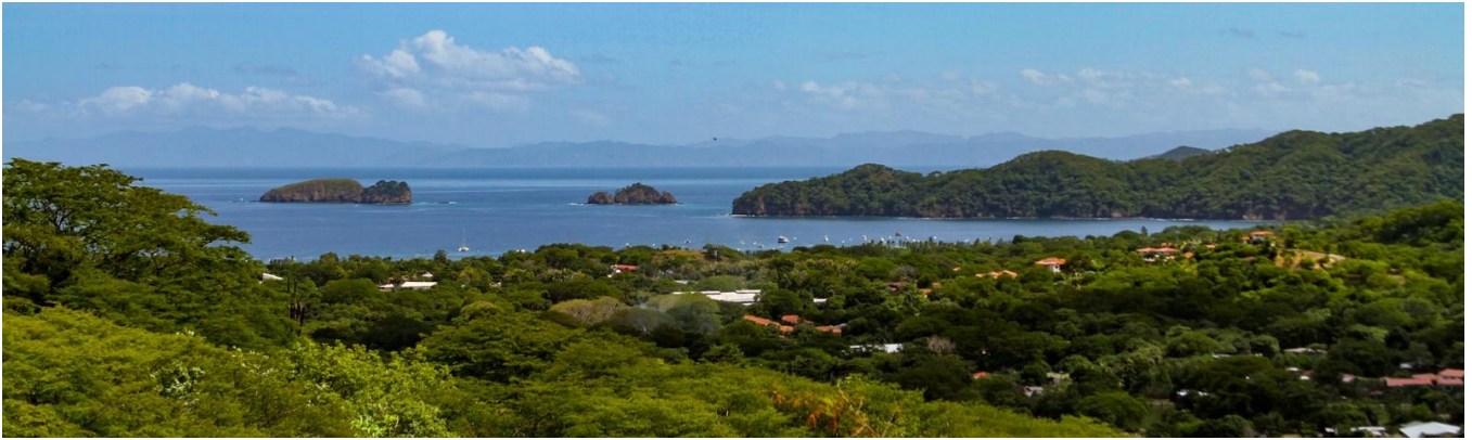
Top Level Building Pad