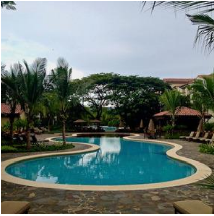
Poolside Bar & BBQ