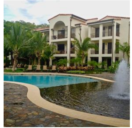
4 Community Pools