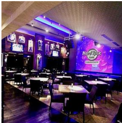
Hard Rock Cafe