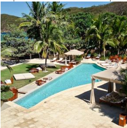
2 pools & private Cabanas