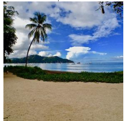
Free shuttle from Development