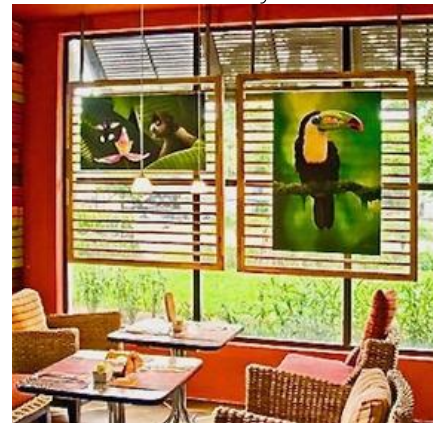
Coffee shop & Restaurants