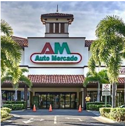
Supermarket & Retail Shops