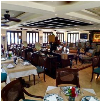
Dining room at Beach Club