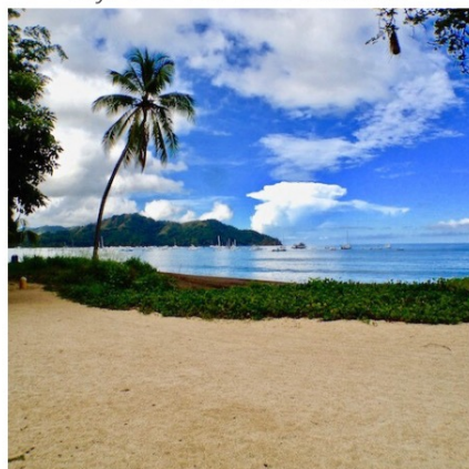
Free shuttle to Beach Club