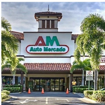
Supermarket & Retail Shops