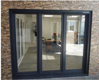
Black Aluminum frame with clear floated glass (EUROPA)