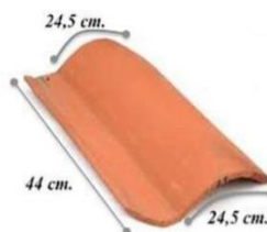
Spanish Style Clay Roof Tile Teja Imperial