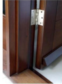
Chrome finish hinges