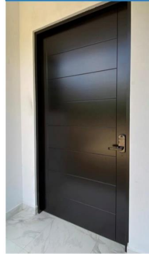
Interior Doors Lever