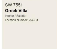
SW 7551 Greek Villa Interior / Exterior Location Number: 254-C1