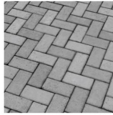
PAVING STONE IN THE DRIVEWAY