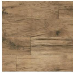
MAIN HOUSE FLOOR AREA