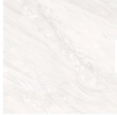
TERRACE FLOOR AREA